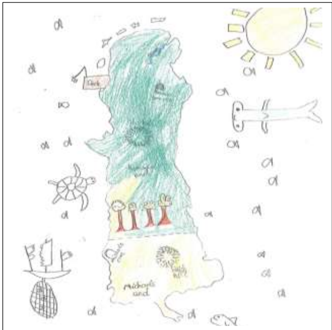
Map of Kensuke's Kingdom By Lois Duck